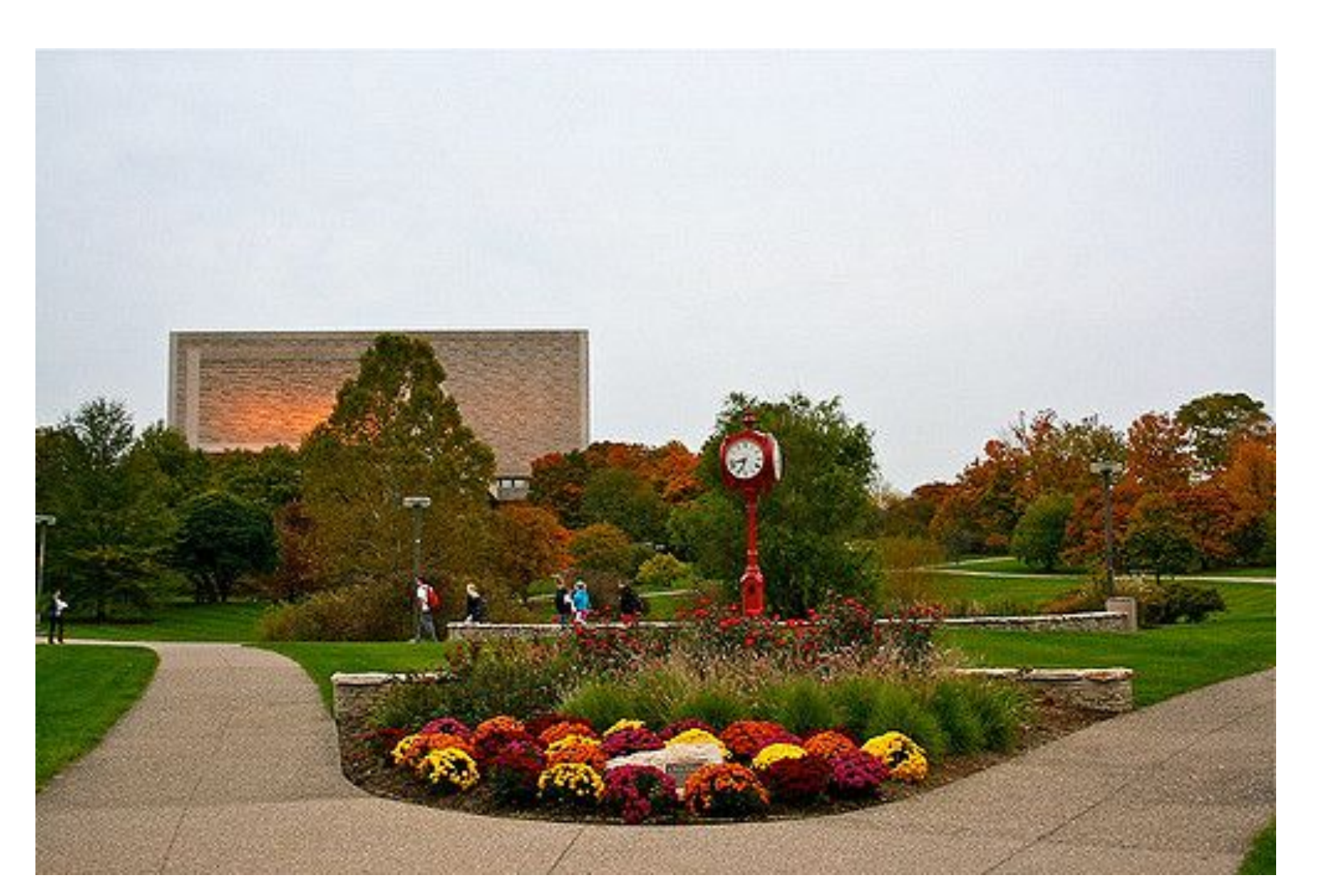
Figure 1. Indiana University Arboretum in the fall (Smith, 2009).

In March 2010, Indiana University Bloomington released the new Campus Master Plan. This plan outlined many goals for the future of campus, but most were not directly associated with a particular timeline. One goal the University outlined was to increase tree canopy cover on campus from 20% to 40%. The Arboretum, as well as the Jordan River corridor, will be instrumental in achieving this goal.