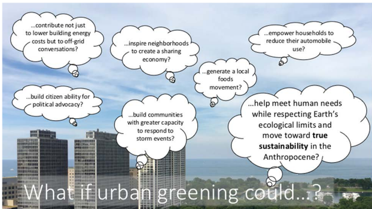
Figure 2. An invitation for to urban forestry and urban greening to perpetuate dialogue and action towards sustainability in the Anthropocene. (Background photo: Lake Michigan over rooftops in the City of Chicago.)

In closing, I invite the reader to join me in a brief thought experiment. Recall that sustainability in the Anthropocene is about meeting the needs of human communities without compromising the ecological integrity of our planet by overusing natural resources and polluting our land, air, and water (Steffen et al. 2015b; Raworth 2012; Leach et al. 2013). If the main question lurking in this piece is, How can we in the urban forestry and urban greening communities help our cities deal with the challenges of the Anthropocene and foster transitions to sustainability? , then would not the best way to do this be to keep the needs of human communities and the ecological integrity of planet Earth constantly in our mind during our daily professional practice? Consider the following hypothetical questions (Figure 2):